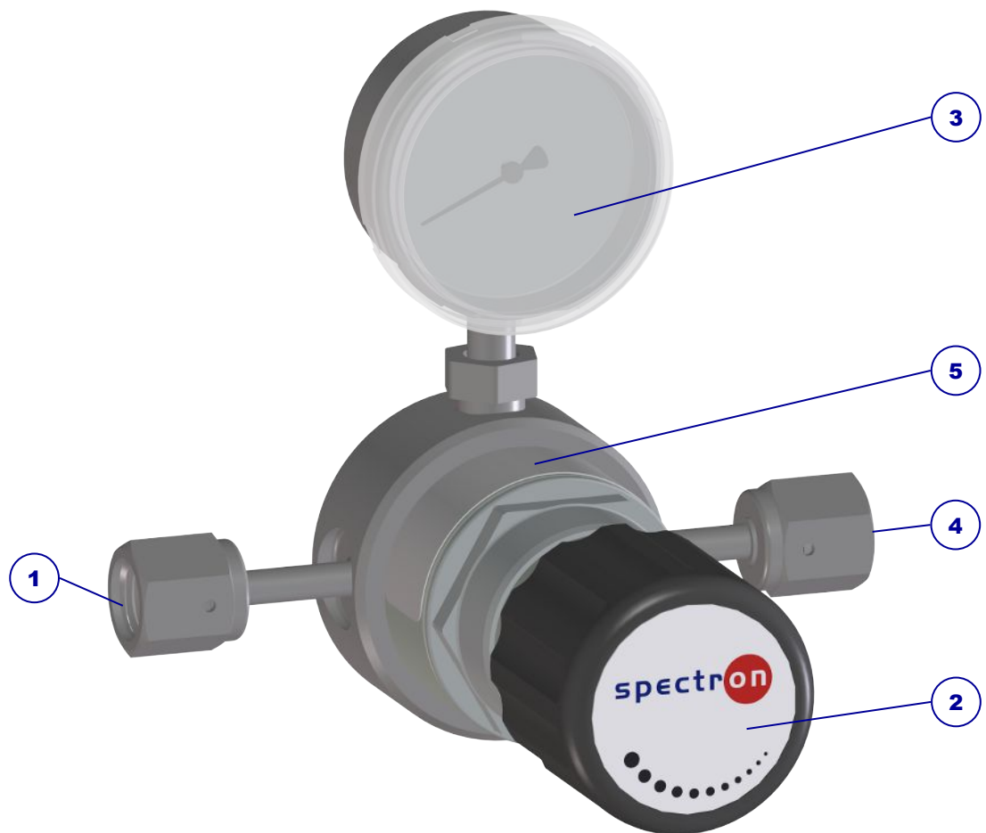
Illustration 1: Pressure regulator design E53-VCR

The design described is an example. The product design may vary depending on the configuration.