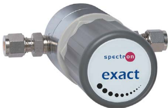
Line regulator LM52 exact -2